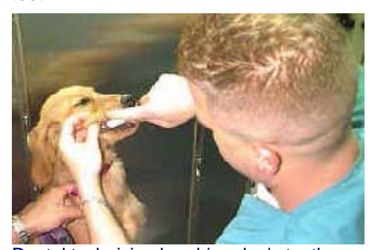
Dental technician brushing dog's teeth

What are the benefits? Brushing removes the daily accumulation of plaque from the teeth. Even though dogs do not commonly get cavities, they do suffer from periodontal disease. If untreated the gum disease can lead to pain and loss of teeth.