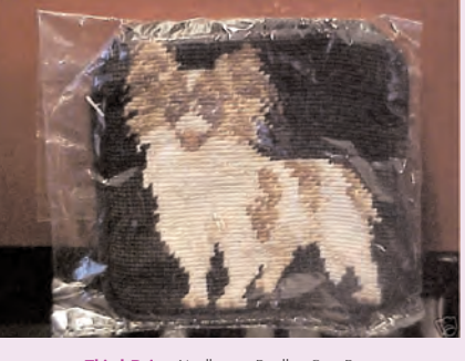
Third Prize: Needlepoint Papillon Coin Purs