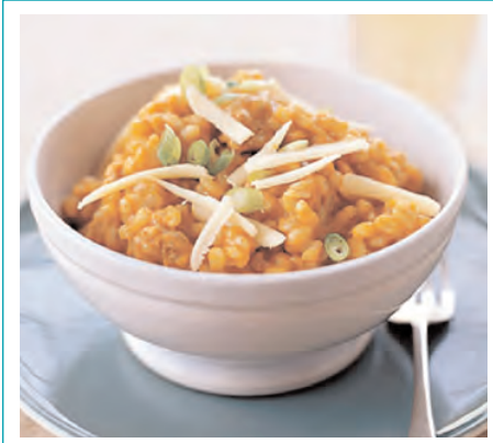
4 Servings Prep 10 min – Cook 35 min