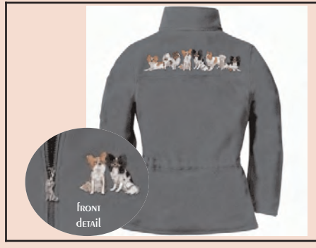
Grand Prize Papillon Fleece Jacket (Size: Large)

For this special event, PapHaven's free gift to you for supporting our organization with your purchase, will be an automatic entry in Our Mother's Day Raffle Fundraiser!