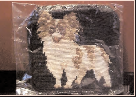
Third Prize Needlepoint Papillon Coin Purse