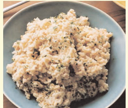
4 Servings – Prep 10 min – Cook 22 min