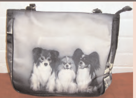
Second Prize Papillon Hand Bag