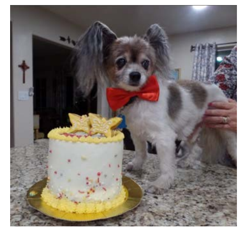
I don't think this little guy is one of ours, but I just had to share ... Recently Poco celebrated his 17th birthday!

DON'T leave trash cans open. Open trash cans are an easy target for your dog to get into trouble quickly. Even a small