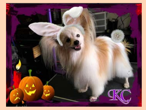
Momma says they are such good sports about costumes!