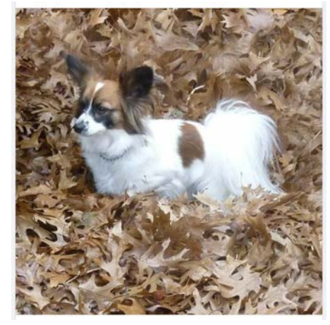
Scotty is getting into the fall spirit and enjoying some time playing in the leaves.

If your pet eyes never leave you, the chances are high that they are just waiting for you to give them a treat, or show them your affection. After all, who can resist those puppy dog eyes, but sometimes staring can be a sign of aggression, that's why, before starting back, you should make sure that the dog isn't scared of feeling threatened.