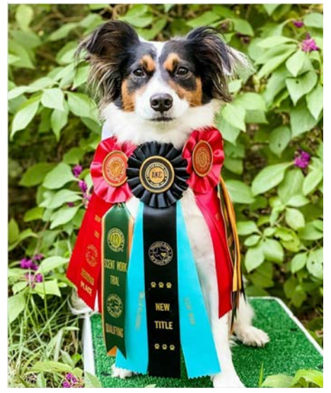
Panda continues to succeed in scent work! She had a wonderful time at the Houston trials where she earned a few new Qs, new placements, and a new SHDNE title! Congrats!!!!!

This scenario is familiar to a lot of dog owners, your dog whether it's a boy or a girl mount another dog during the walk in the park, humps their favorite stuffed toy, or even tries to hump your leg. My dog Riley still does that, and he's 9 years old, will fit say that humping or mounting is it typical sexual position for dogs. If a dog is not neutered or spayed and younger than one year old, this is exactly what the dog is seeking, some form of a complex. However when a dog is fixed and mature, this