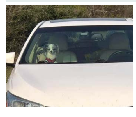
Solo says come on ... we got to get to our next stop! Solo is out cruisin' Texas this fall.