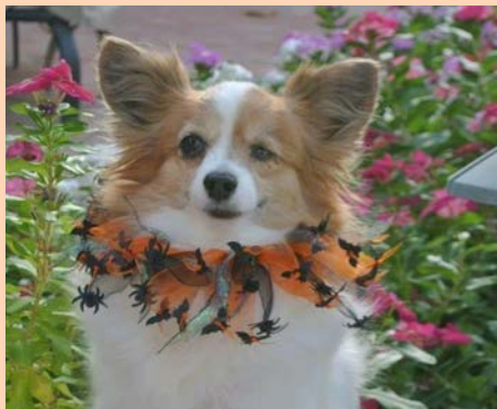
Millie (above) is just as cute as can be!