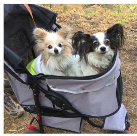
Bleu and his foster sister Beanie were out for a stroll in Yosemite with their Mom on Halloween day!