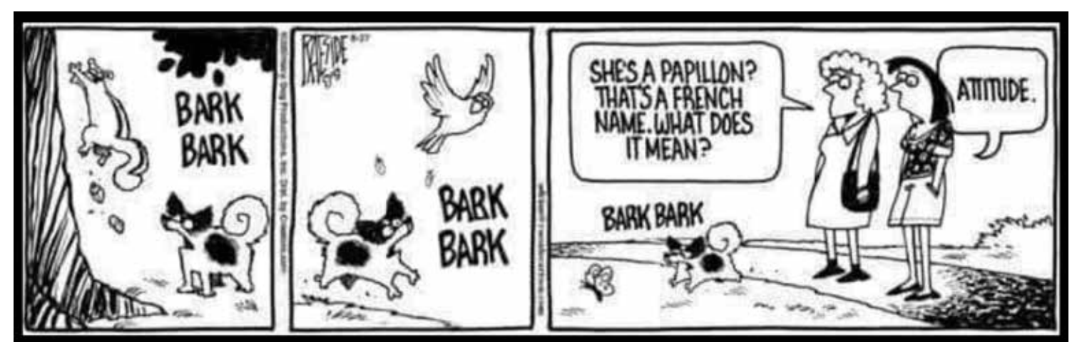
Issue 97 – Fall 2021

Vaccinating your pet is super important so don't lose the overall message here: "VACCINATE, JUST DON'T OVER-VACCINATE!"