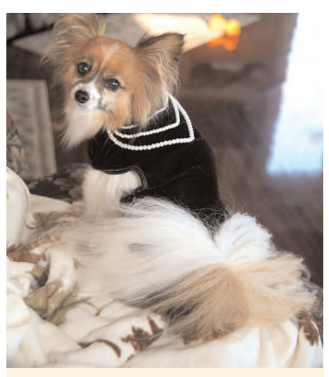
Bella Fournier is ready for the party!

Onions and garlic, which flavor many appetizers, can destroy your pet's red blood cells and cause anemia. Grapes and raisins can cause kidney failure, dairy products are likely to create digestive upset, and desserts with macadamia nuts or chocolate could be fatal. Even one taste of alcohol – beer, liquor,