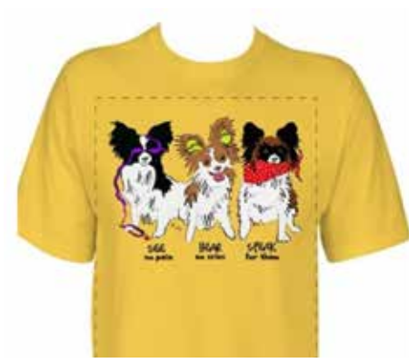
Available colors: Island Yellow and Columbia Blue Columbia Blue. Most all sizes available.